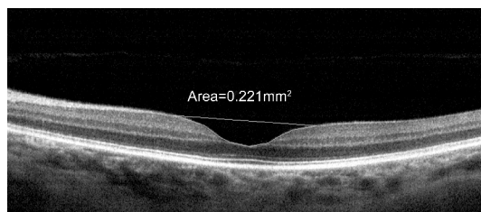
Figure 2 SD-OCT foveal configuration measurement in mm 2 : fellow eye of patient with IMH.